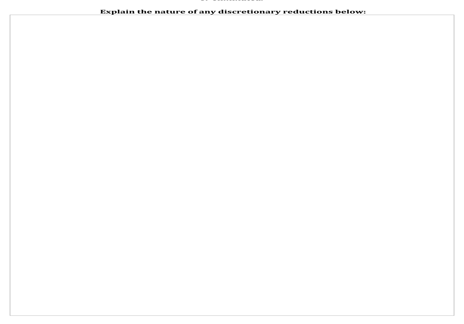
Section 1G: Determine any other discretionary State General Fund spending that can be reduced or eliminated.