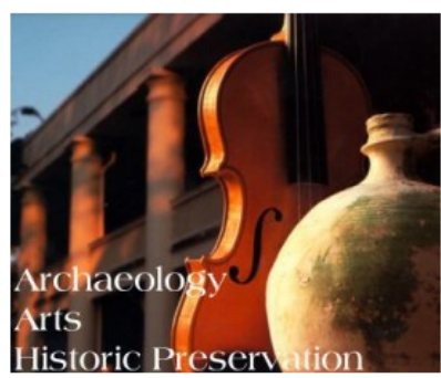
Office of Cultural Development