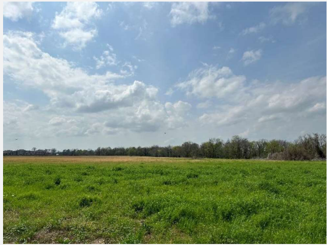
View of the subject site, taken looking north from the subject site southeast boundary