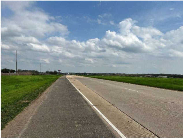
View of Interstate 220 taken looking east from the subject site south boundary