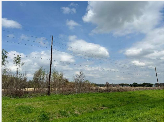
View of the subject site taken looking northeast from Interstate 220