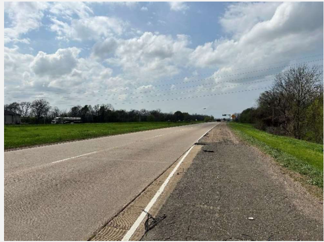
View of Interstate 220 taken looking west from the subject site south boundary