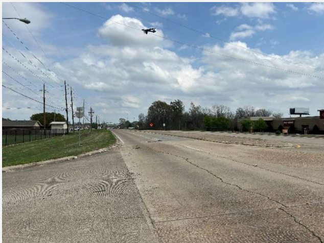
View of Shed Road, taken looking east from the entrance drive at the adjacent property (location of the 30' right of passage)