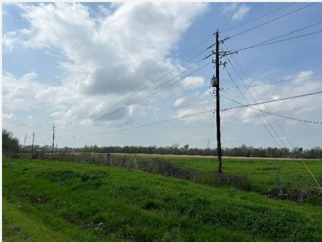
View of the subject site taken looking northwest from Interstate 220