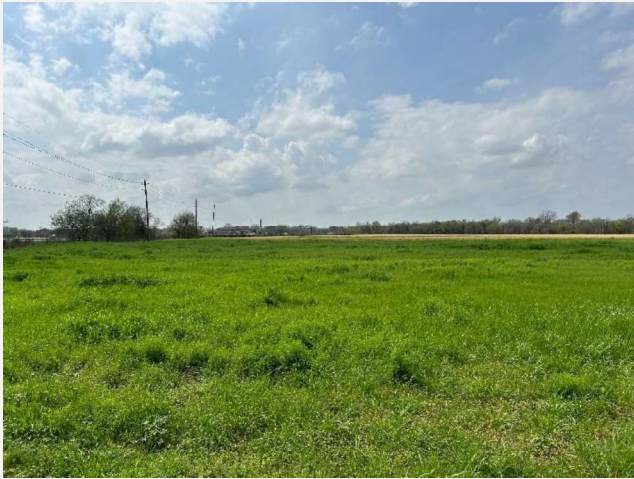
View of the subject site, taken looking northwest from the subject site southeast boundary