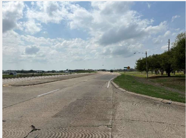
View of Shed Road, taken looking west from the entrance drive at the adjacent property (location of the 30' right of passage)