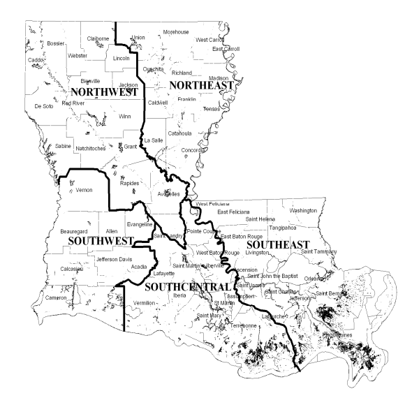
Figure 2. Statewide Flood Control Program Five Funding Districts for Rural Projects